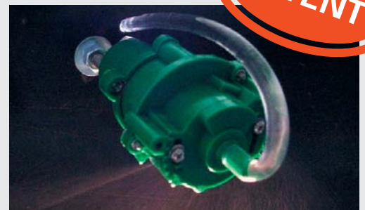
US-Pat. 5,788,156 EU-Pat. EP 0 776 252 B1

Specially developed by Mantis, segment rotation nozzles make for easier, more effective spraying. All MANKAR® ULV Spraying Systems are equipped with this patented nozzle.