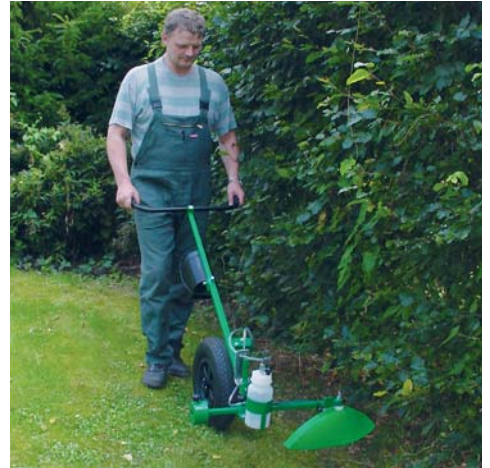
Model: MANKAR-L (spray cover left; optionally on right)