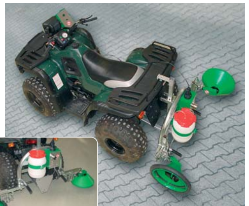
Model: VARIMANT-2 with quad